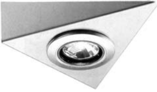
LV stainless steel triangular light with 10/20W halogen lamps by Hettich